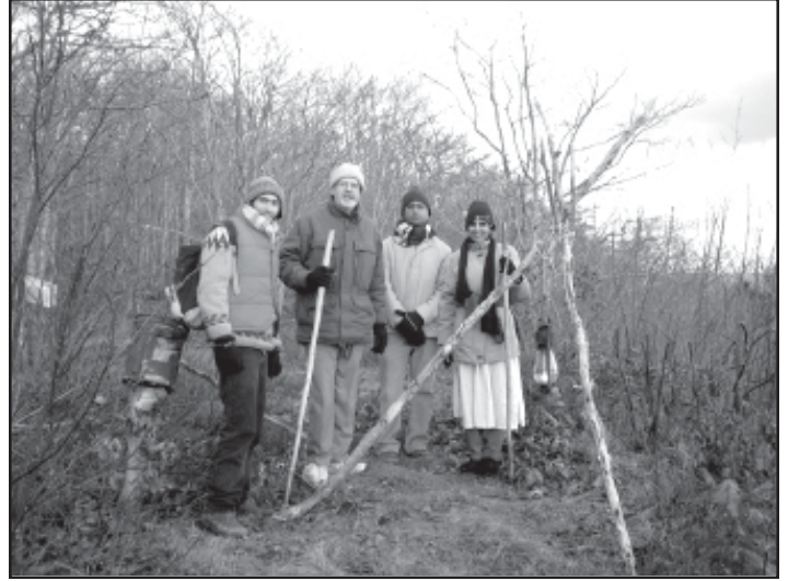
Devotees lighting Deepam on top of North Mountain

From the cave we continued our ascent. I had never been to this part of the mountain and we might have discovered another cave that the previous owner had told us about, but was never found, but we had no time to explore; this was not part of our mission and darkness was speedily approaching. While traversing these boulders en route to the top, one of the pilgrims brought our attention to the Arunachala Hill of the youthful poet-saint Jnana Sambandar. He said that this North Mountain must have resembled the densely forested Arunachala that Jnana Sambandar described in his hymns one thousand years ago. While we don't have anything that resembles the freely roaming elephants, we do have the bears he wrote about.